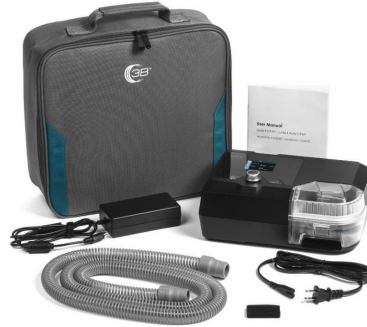
LG2000 - Luna II CPAP LG2A00 - Luna II Auto CPAP

Introducing the new Luna II. Identical user interface menus and button functions to Luna, but in a smaller and lighter enclosure. One piece unibody construction means fewer parts and a drastically lighter device. Available in both CPAP and Auto-CPAP. 3B Medical also goes to the head of the pack with the most advanced cellular M2M communications technology in the industry. The Luna II incorporates 4G LTE Cat M1 and NB IoT, with network support on both Verizon and AT&T, increasing cell coverage to even difficult to reach geographical areas.